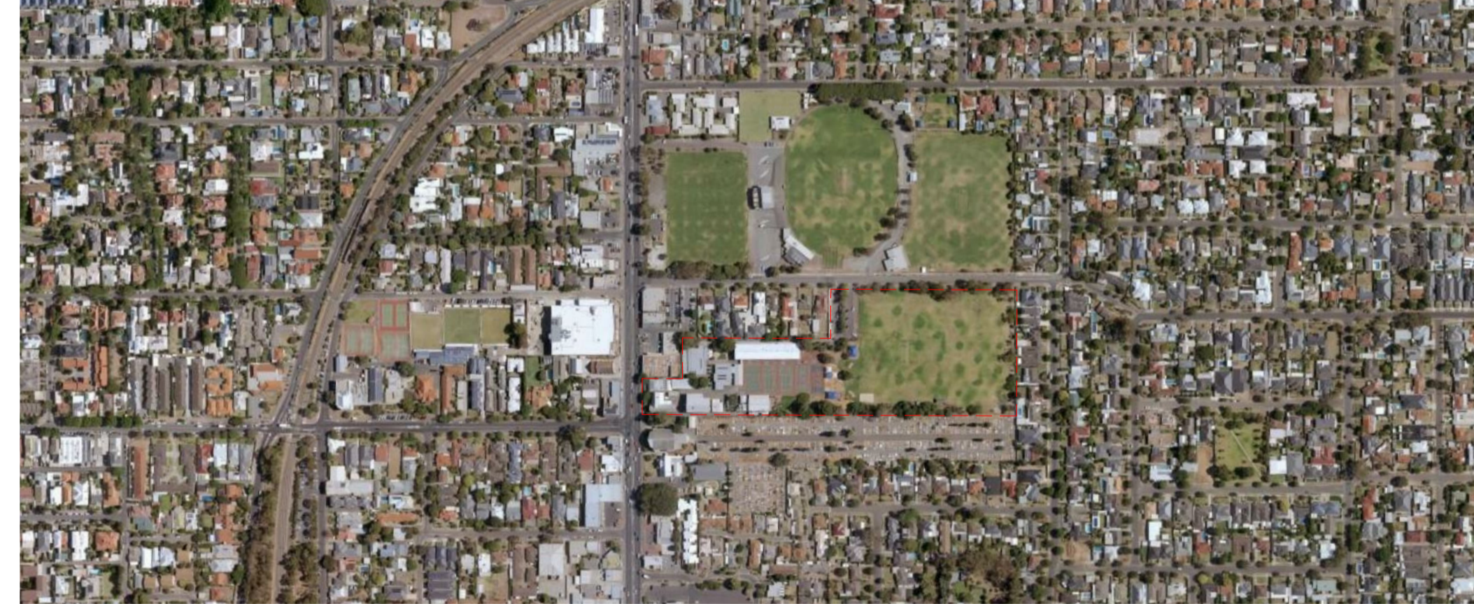
LOCATION PLAN - NTS